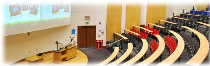
Lecture Room setting

In your first year, you will study five law-based modules plus one non-law module called Widening Horizons Modules (WHM), which you will choose during Freshers' week. This section gives a brief breakdown of the law-based modules, what they consist of, and advice to Freshers.