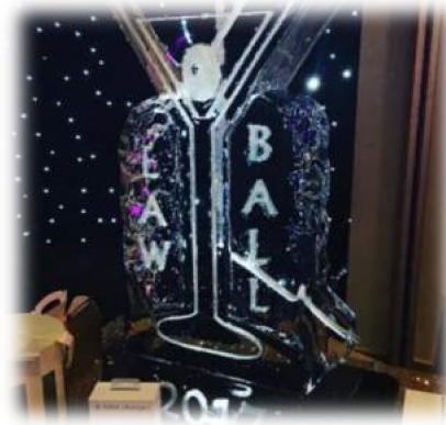
Holdsworth Committee - 2016-17