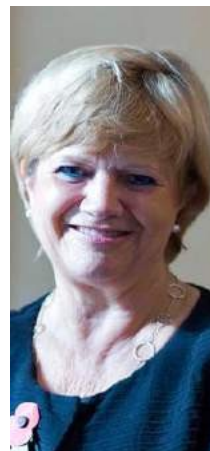
(3) Baroness Kennedy of The Shaws