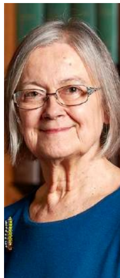
(2) Lady Justice Hallett