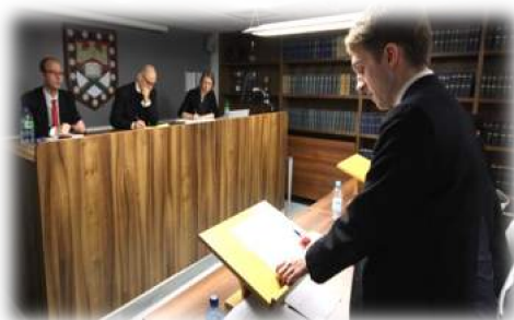
Moot court setting

Mooting plays an integral part of our Club. We work alongside CEPLER and other sponsor organisations. Moots will simulate a court hearing where participants analyse a full legal problem, research the relevant law, and apply their knowledge through a written oral submission. The moot topic is based on an unsettled area of law that draws academic and practitioner debate.