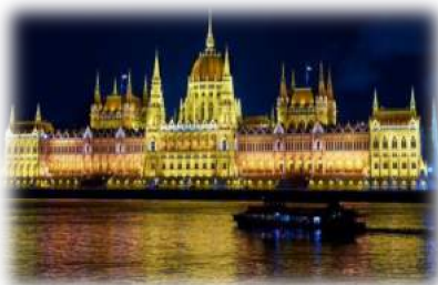
Budapest - 2016 Trip

Every year, Holdsworth organises a trip at the beginning of the Christmas break, with past destinations including Berlin and Budapest. This is a great way to meet new people and get away from the wear and tear of reading law. This year we're planning something a bit different. Details will be provided in due course.