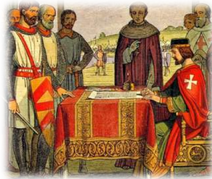
Signing of the Magna Carta

Public Law is focused on the UK's legal and political institutions and the devolution. This includes studying the devolution and allocation of the power within the State (Executive, Legislative and the Judiciary) and the legal power over public authorities (Judicial Review). Keep up with current affairs by watching the news; alternatively, you can follow news pages or newspapers on social media and download a news app.